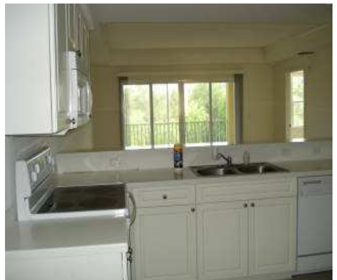
Kitchen, Corian Countertop, microwave, fully equipped.