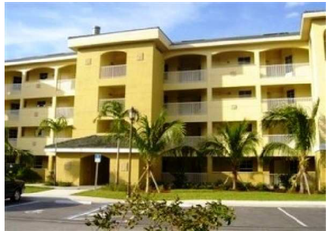
Building is adjacent to the clubhouse, pool, and tennis courts.