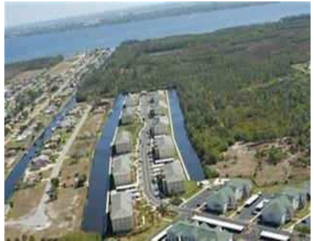
Eco Park shown to the right, Caloosahatchee River in the background.