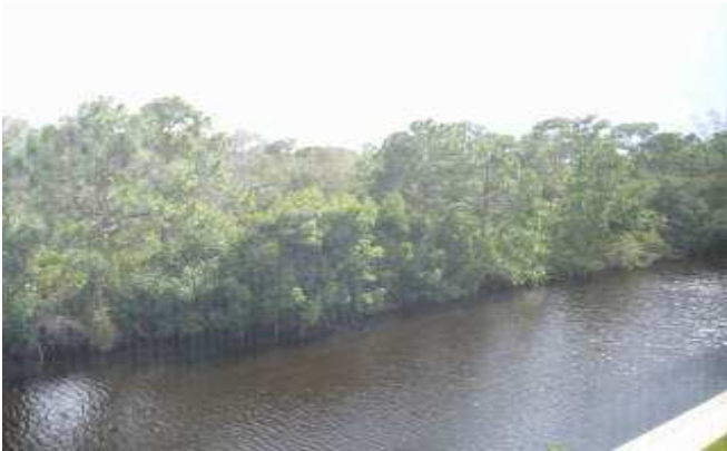
View of Eco Park from the Lanai.