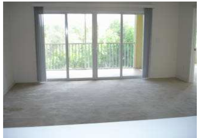
View of Great Room , soon to be tastefully furnished.