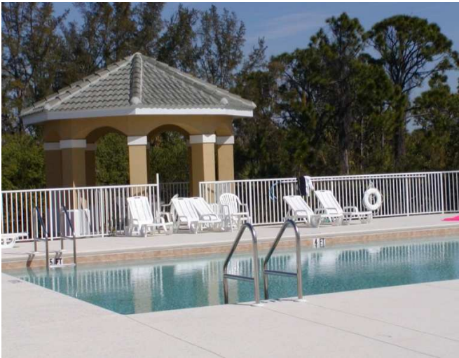
View of pool.