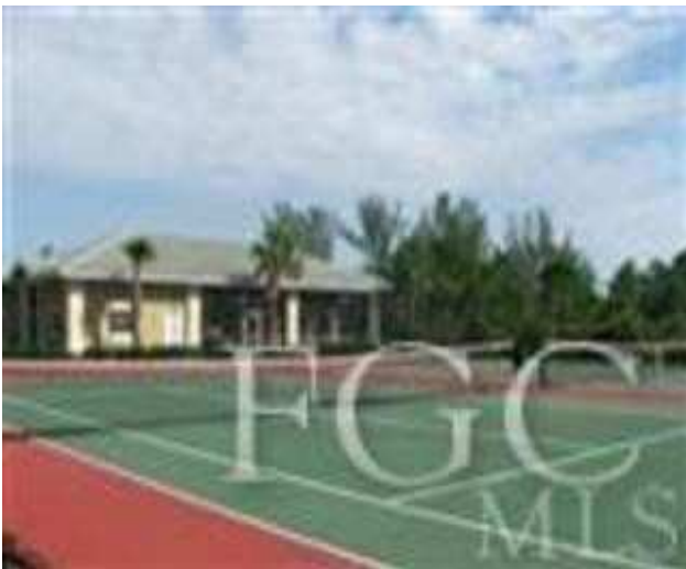
Tennis courts, Clubhouse in background.